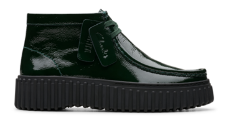
Green Patent | CL26184663 | RRP 1599