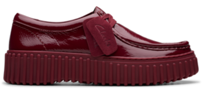
Bordeaux Patent | CL26179115 | RRP 1499