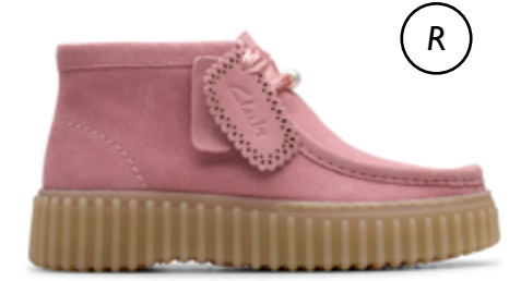
Dusty Rose Suede | CL26184636 | RRP 1599