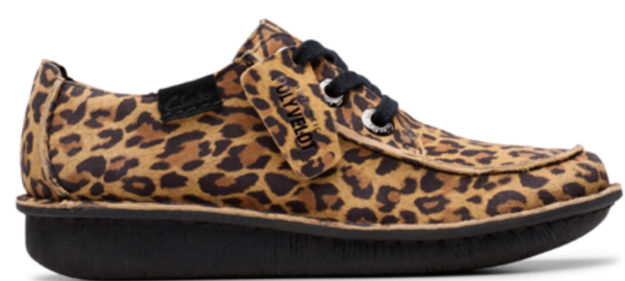
Leopard Suede | CL26183040 | RRP 1399

Premium leather | Breathable leather sock and lining | Grippy and flexible TPR outsole | UK 3-8, EU 35,5-42