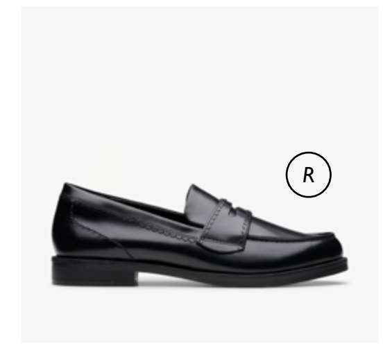
Black Leather | CL26181277 | RRP 1499

Designed for real life, your life - Our Straven Edge loafer is a hybrid shoe expertly crafted for easy everyday styling and iffice days alike. Prepped for ultra-versatile wear in rich leather, it features a scalloped trimmed upper and wheeling rand detail to create a crafted aesthetic - whoæe our signature Contour Cushioned footbed is expertly placed for comfort that lasts as long as your day does.